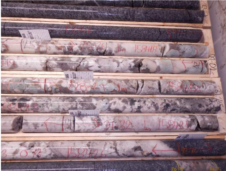
Figure 2 PWM-18-71, zoom in on boxes 6 and 7 showing multiple pale green coarse-grained spodumene crystals.

Power Metals is pleased to announce that we are now planning the spring/early summer exploration program on Case Lake Property, Cochrane, Ontario which will consist of two parts: