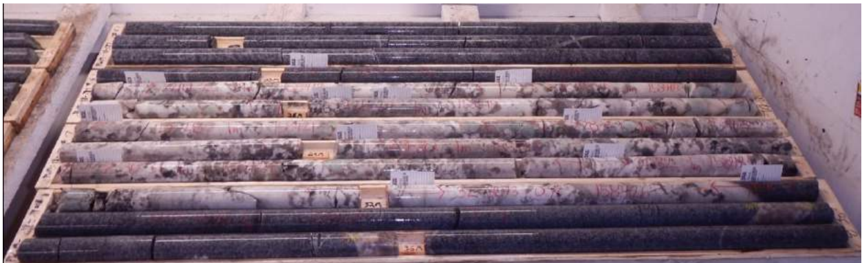
Figure 1 PWM-18-71, Boxes 5-8, 18.2-35.8 m. Note coarse-grained pale green spodumene inner intermediate zone in boxes 6 and 7.