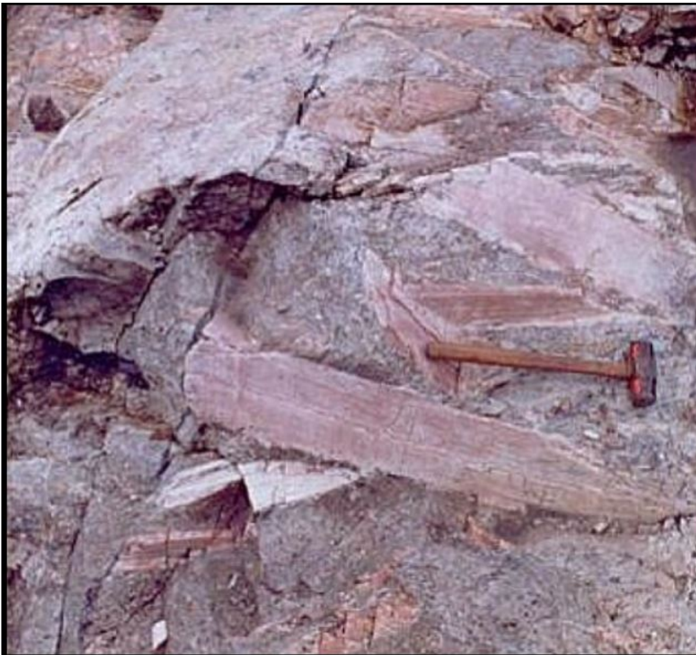
Figure 2 Large pink spodumene blades in Tot Lake pegmatite (Breaks and Janes, 1991).