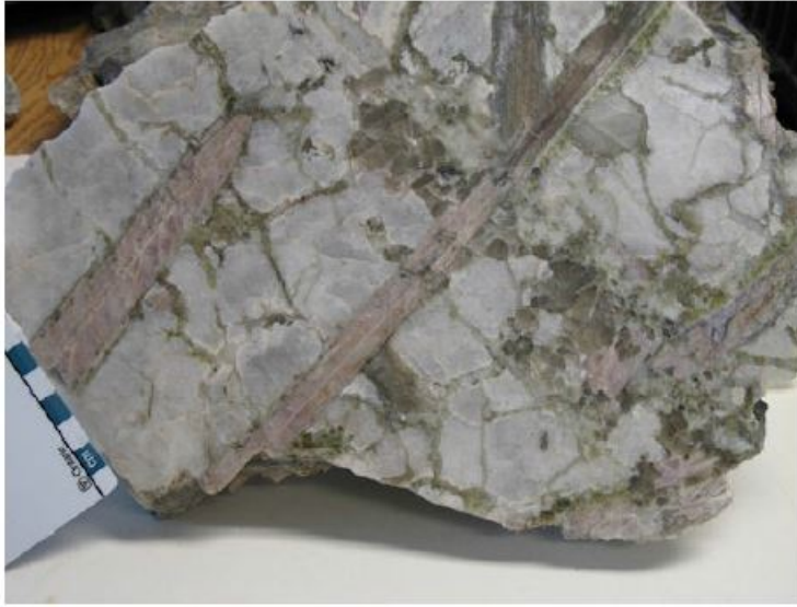
Figure 1 Pink spodumene blades, white pollucite and green muscovite from Tot Lake pegmatite pollucite zone (OGS OFR 6224, 2008).